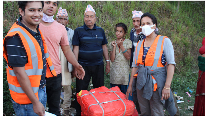
Relief materials being handed to the victims.