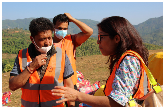
NRNA, ICC volunteers discussing at Gorkha.