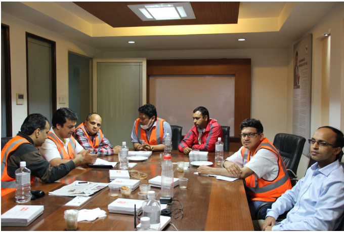
NRNA, ICC Meeting before dispatch for Gorkha.