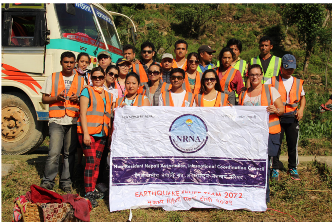
NRNA, ICC Earthquake Relief Team at destination.