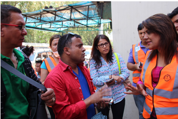
Celebrities discussing with NRNA, ICC Secretary.