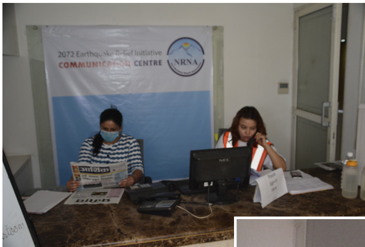
Communication Centre for 2072 Earthquake Relief Initiative at TBI Plaza.