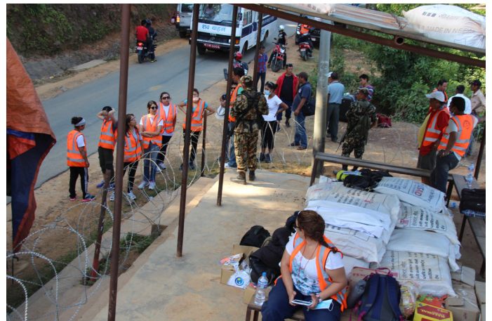
Security personnel providing security to relief materials.