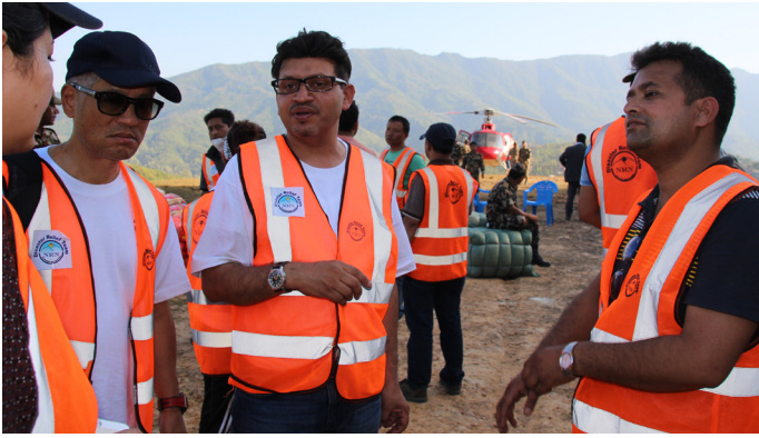
President and vice-president of NRNA, ICC inspecting relief work.