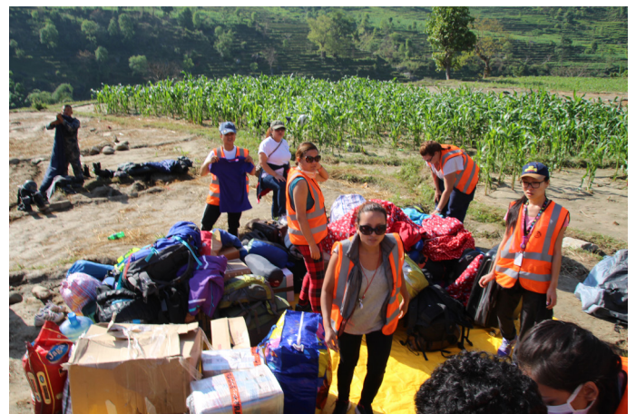
NRNA, ICC volunteers at destination.