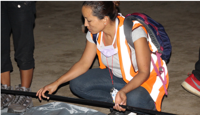
NRNA, ICC volunteer preparing tent for the night.