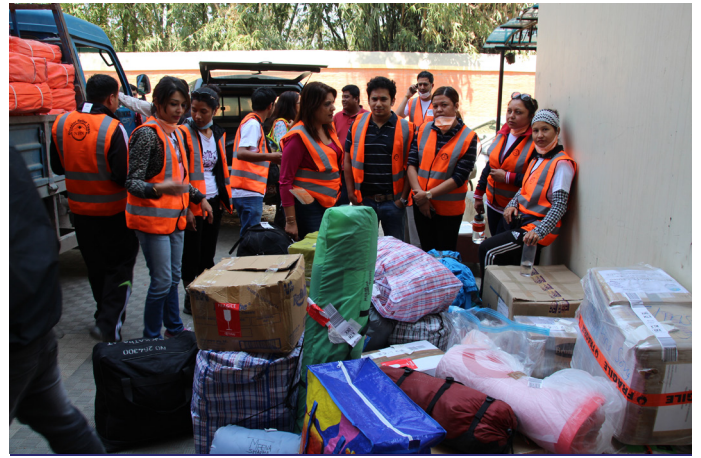
Medical team ready to depart for Gorkha.