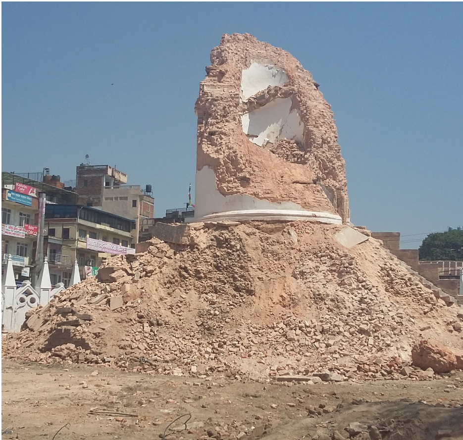
The remains of Dharahara, Kathmandu.