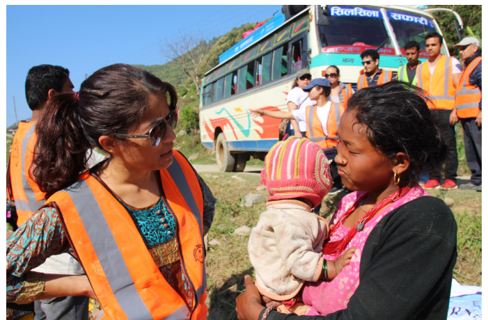
NRNA, ICC volunteer interacting with the victim.