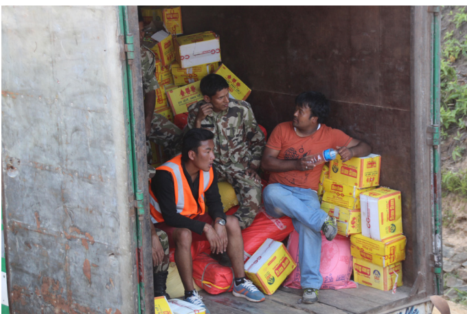
Unloading relief materials at Gorkha.