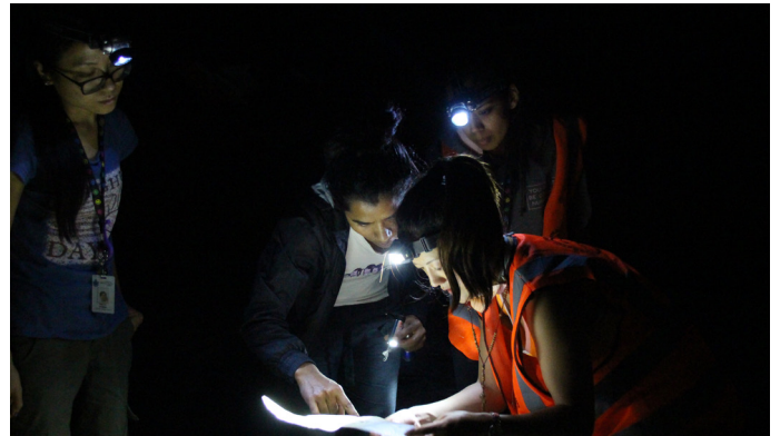
NRNA, ICC Volunteers discussing about relief works.