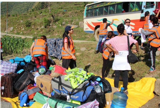
NRNA, ICC volunteers embarking at destination.