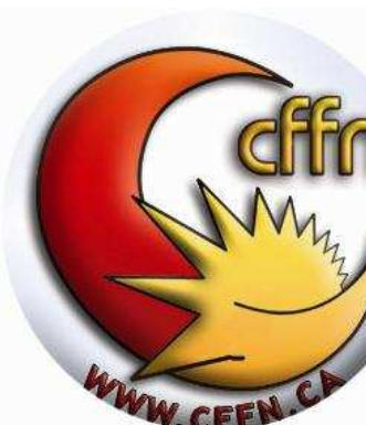
Executive Board Canada Foundation for Nepal Ottawa, Canada