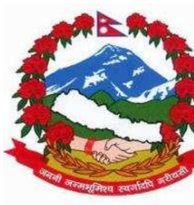
The Ministry of Education Government of Nepal Kathmandu, Nepal