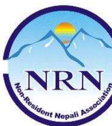
Central Secretariat Nor-Resident Nepali Association Kathmandu, Nepal